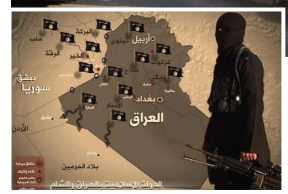
Graphic shared on social media by Islamic State supporters with arrows suggesting that Saudi Arabia & Jordan are their next targets.

Ultimately the group aims at nothing short of total world domination.