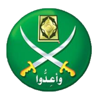
Figure 6 Egyptian Muslim Brotherhood Logo