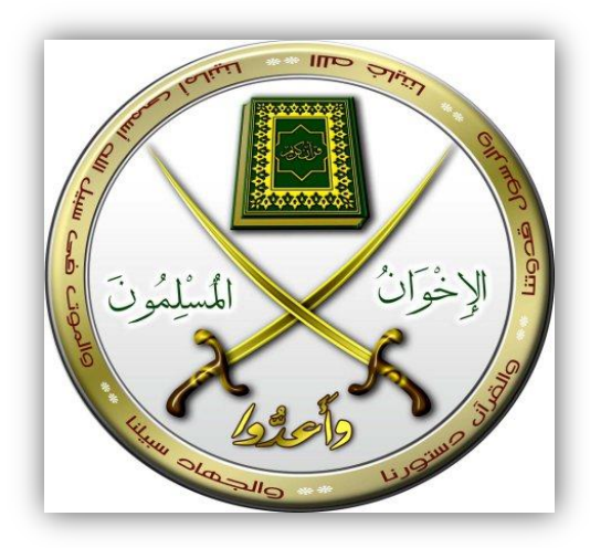
Figure 1 The Brotherhood's motto is written on the outer circle of its logo. The word beneath the swords translates to "Make Ready," which is a reference to a Quranic verse exhorting Muslims to prepare for war against the enemies of Allah (Surah 8:60)

Until recently, the Brotherhood's motto published publically was: "Allah is our objective. The prophet is our exemplar. The Quran is our law. Jihad is our way. Dying in the way of Allah is our highest hope." This motto is no longer displayed on official Ikhwan (Brotherhood) publications.