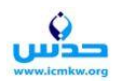
Figure 7 Hadas: Kuwaiti Muslim Brotherhood Logo